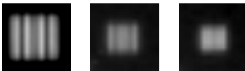
Figure 3: Test patterns as seen by an under sampled thermal imager with four, three, and two bars visible (from left).

Note 4: For a well sampled imager the number of bars that can be resolved is always four and the MTDP corresponds to the MRTD.